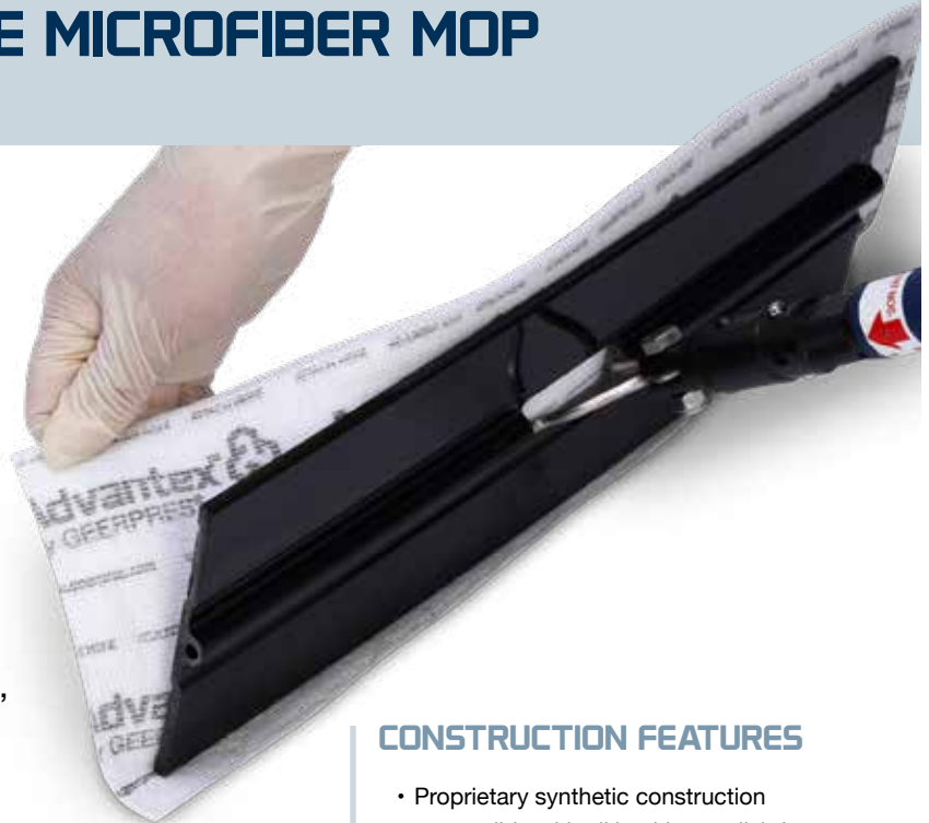
#4832 Advantex ® 18" x 5" Single-use Microfiber Mop

Designed for daily floor cleaning in healthcare and cleanroom/laboratory applications, the Advantex ® Microfiber Mop has been tested and proven best-in-class for non-quat binding, disinfection application, solution delivery, and reducing chemical utilization and waste.