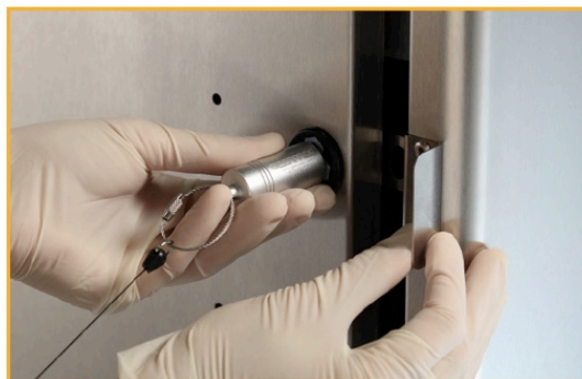
Our E-Key® Locking System MODEL #9972 Patent #9741189