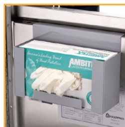
Powder-coated glove box MODEL #380037