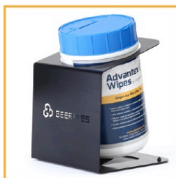
Wipe Cannister Holder MODEL #540200