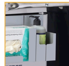
Sanitizer Bottle Holder MODEL #380038