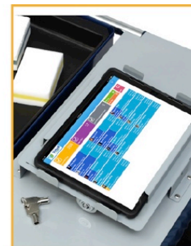
Tablet Holder MODEL #380036