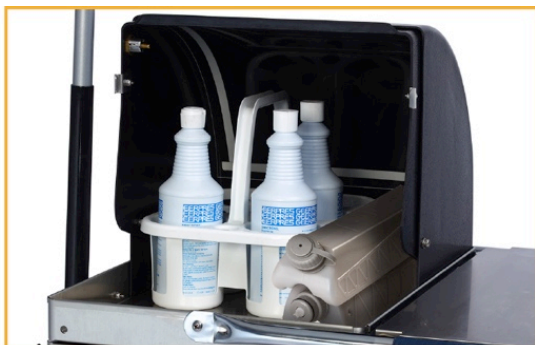
Space Station® MODEL #3885