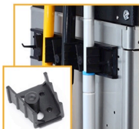
Gripit® Tool Holders / Hooks MODEL #5045 / #5051