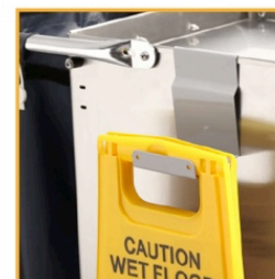
Cabinet / Handle Mount Double Sign Holder MODEL #9916 / #9921