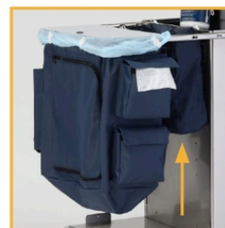
Microfiber Bag System MODEL #100112