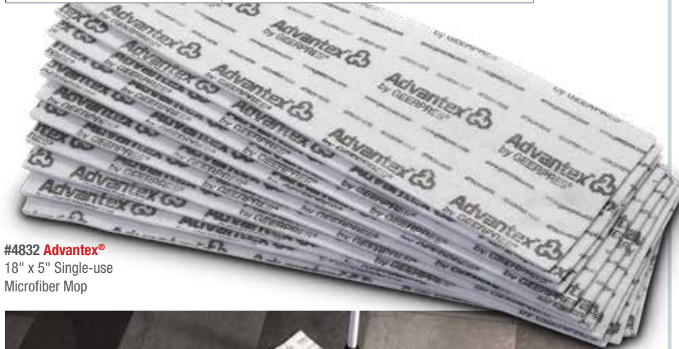
#4832 Advantex® 18" x 5" Single-use Microfiber Mop