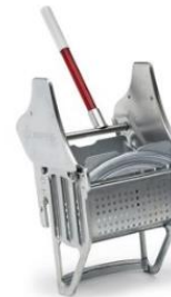
ZINC - PLATED DOWNPRESS WRINGER