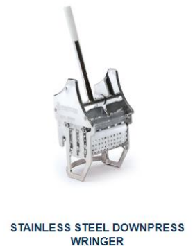
STAINLESS STEEL DOWNPRESS WRINGER