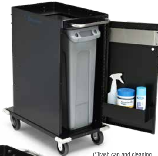
(*Trash can and cleaning products sold separately.)