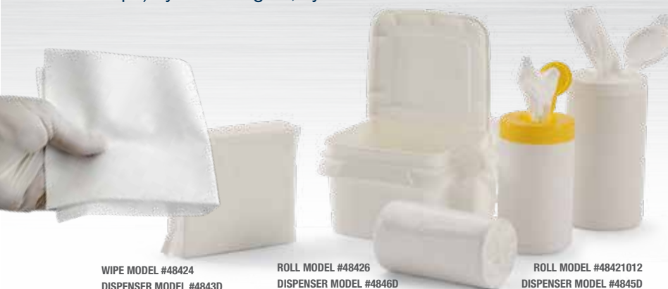
WIPE MODEL #48424 DISPENSER MODEL #4843D

Achieve ideal surface disinfection with the ADVANTEX® Wipe, constructed of 70 GSM (1/4 folded wipe) and 48 GSM (rolled wipe) hydroentangled, synthetic microfibers.